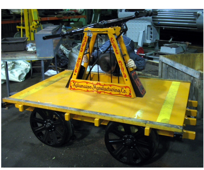
The Kalamazoo Hand Car.