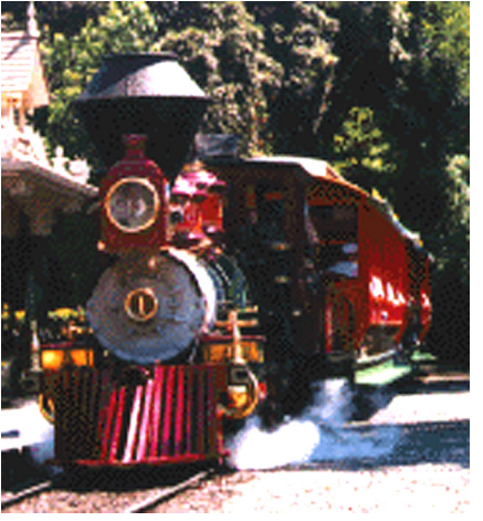
The C.K. Holliday Steam Engine.

We also need help Friday afternoon getting the event set up and looking great. Please come by and help us.