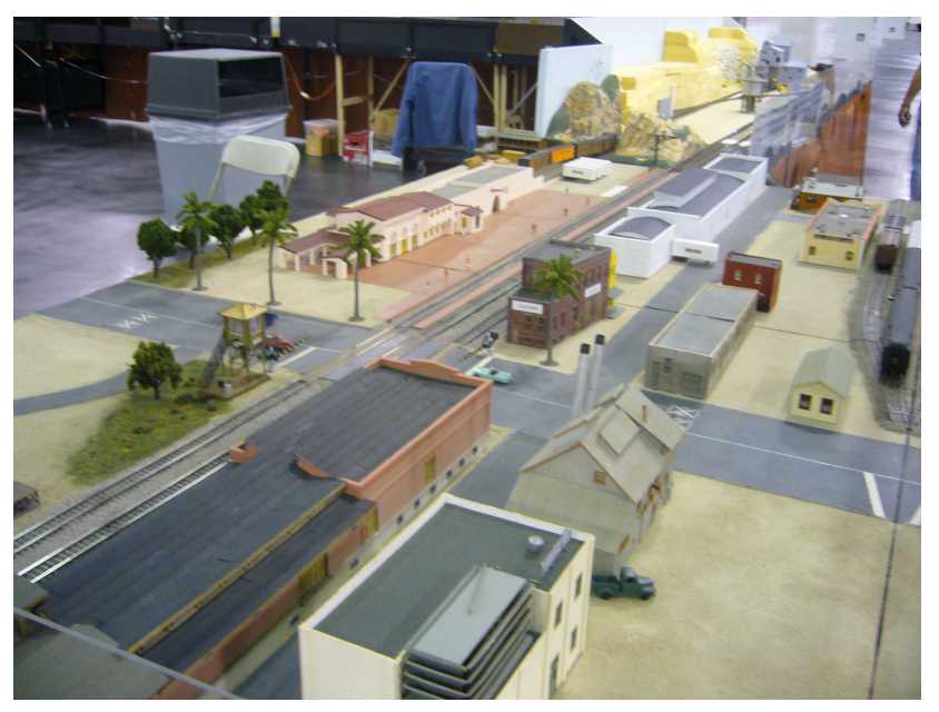
The previous Fullerton Depot Module (above and below).

The signature piece for the old diorama was a beautifully made HO scale model of the Fullerton Depot complete with wrought iron treatments to the windows, roof trim and Fullerton sign. The model, built to 3.5 mm = 1 foot was