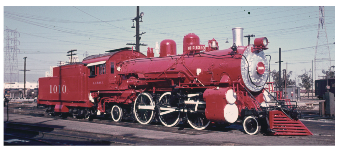
the H&MC will of- Above is a picture of 2-6-2 prairie ATSF 1010 in red paint, date unknown. This locomotive is restored and resides at fer us this 45- the California State RR Museum in Sacramento, and fortunately is back in black and silver paint. Below is a LARY minute program "J" car on the way to Huntington Park and South Gate, circa 1955. From the slide collection donated to FRPA.

To educate our youth and provide all people an historical insight into the numerous contributions the railroads have made to the creation and economic development of the City of Fullerton, the County of Orange, and Southern California from the 19th century to the present and into the future.