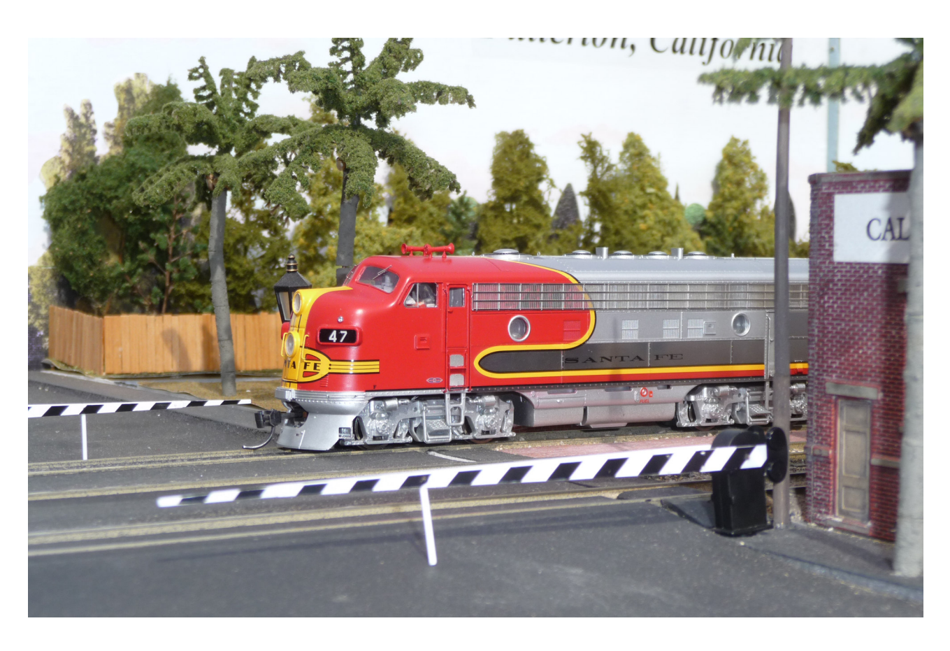
Two more of the ATSF Fullerton Modules.