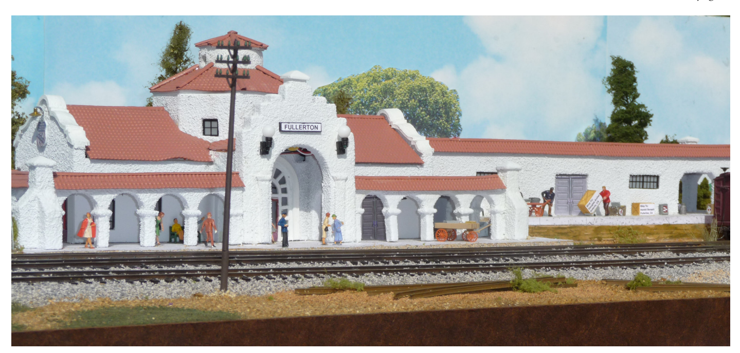
The UP Fullerton Modules (this page) depict the Union Pacific Fullerton Depot and packinghouses circa 1955.