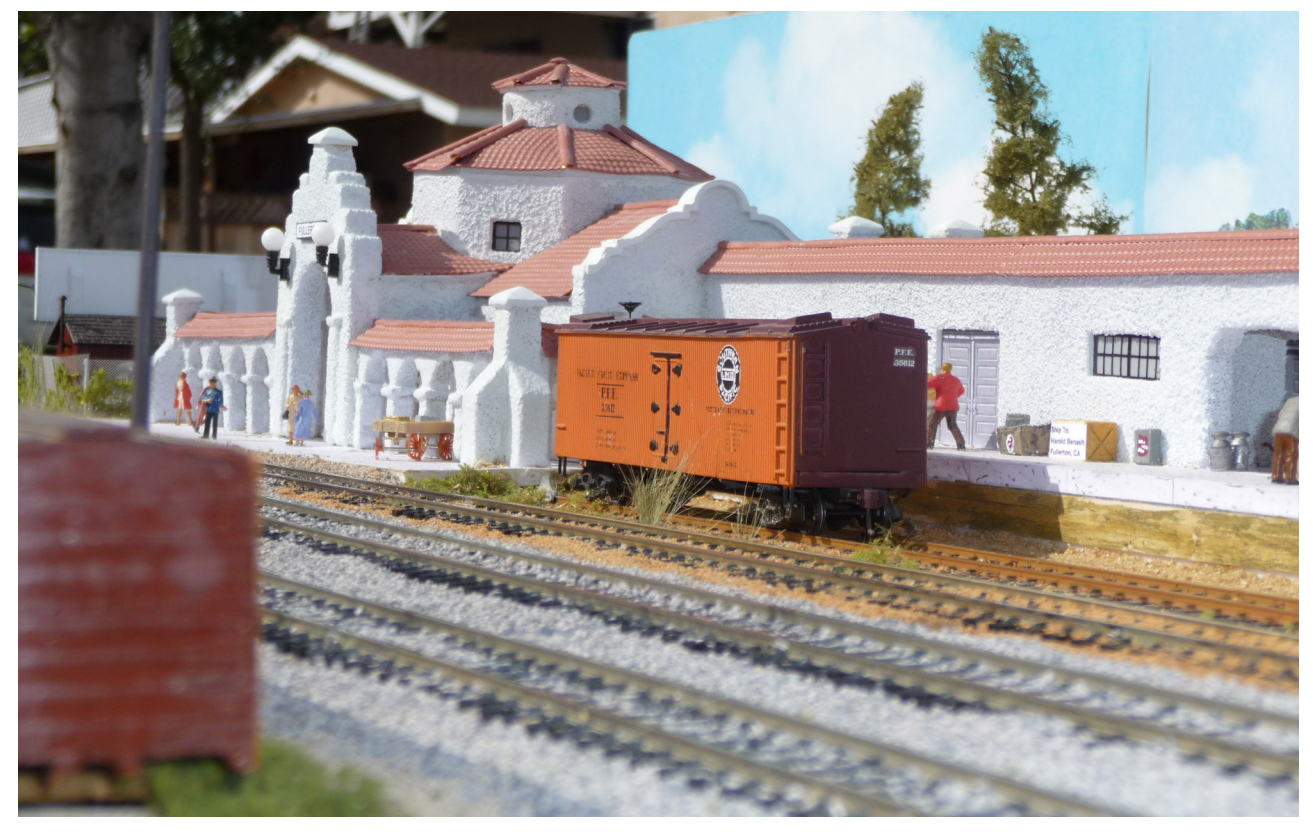
A boxcar stands on an overgrown siding in front of the Union Pacific Fullerton Depot.