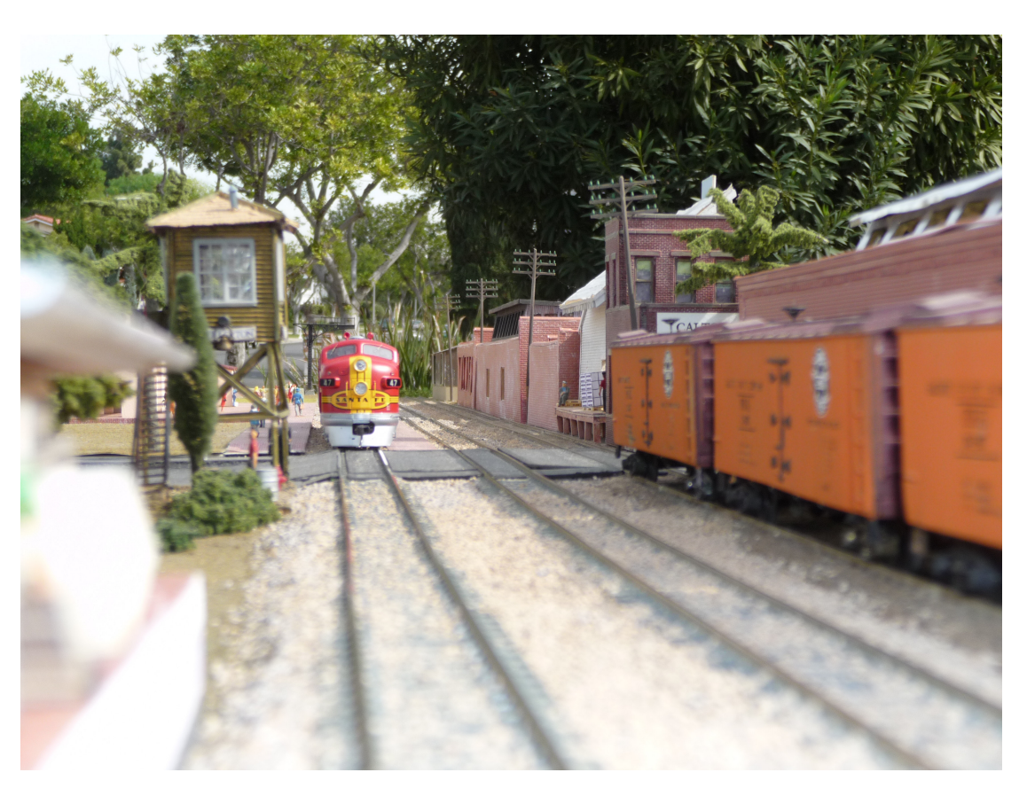
These ATSF Fullerton Modules depict the area around the ATSF Fullerton Depot and packinghouses circa 1955.