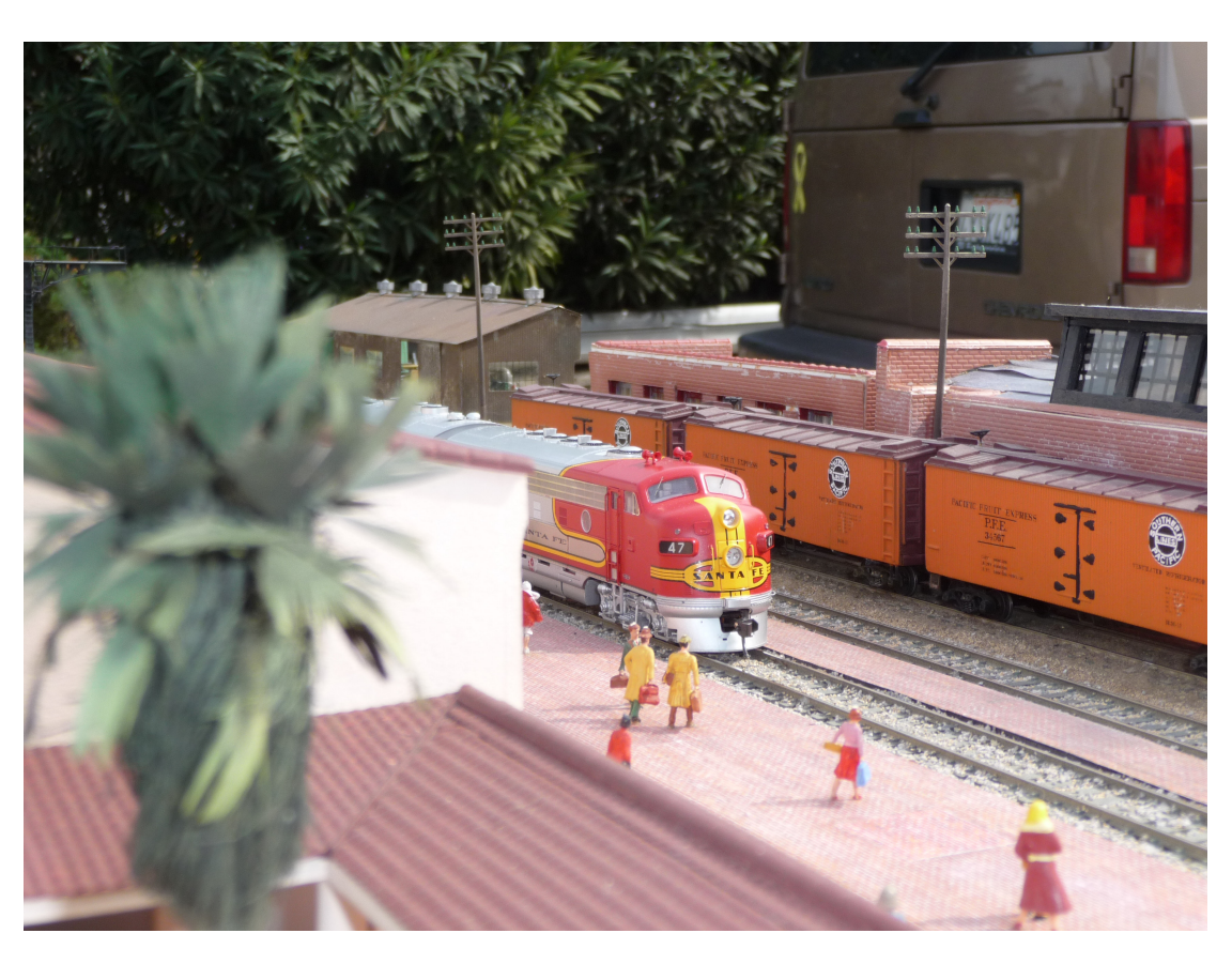
More photos on pages 6 and 7