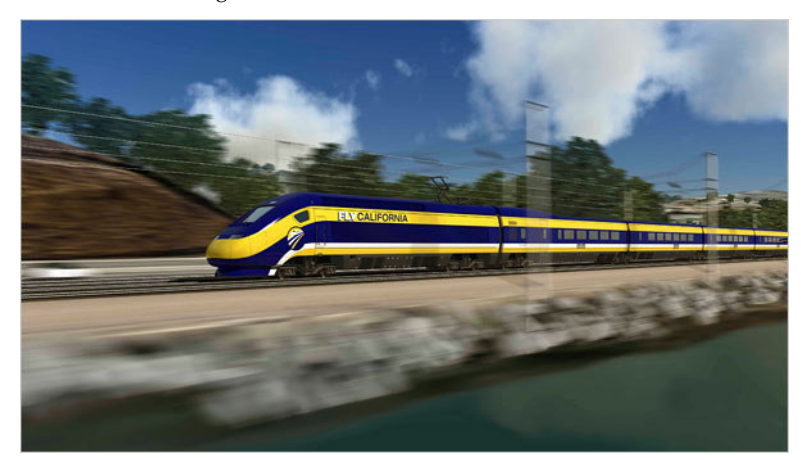
Artist's conception of the proposed California High Speed Rail.