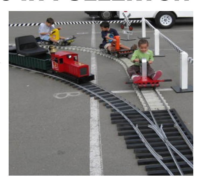
Backyard Railroad Co. riding train for kids

For more information, see <a href="www.SCRPA.net">www.SCRPA.net</a>, or leave a message at 714-278-0648.