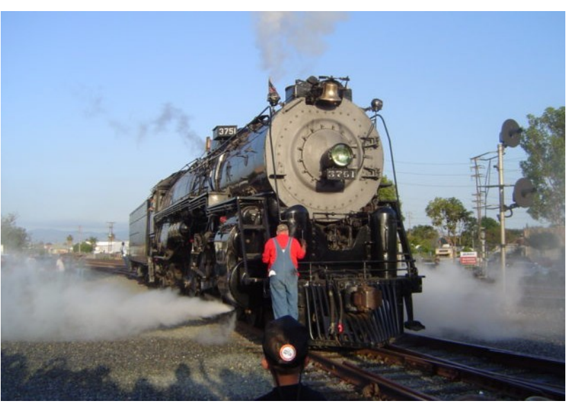
3751 arrives in Fullerton under steam for Railroad Days 2008. Visit for 2015 event offers a rare chance to get up-close to a working steam locomotive and talk to her crew.

The success of the Santa Fe Northern notwithstanding, the 3751 class was rebuilt several times over the years. Conversion of all 14 engines from coal-fired to oil and the addition of a new and larger oil tender completed the first rebuild. A second rebuild beginning in the late 1930s saw