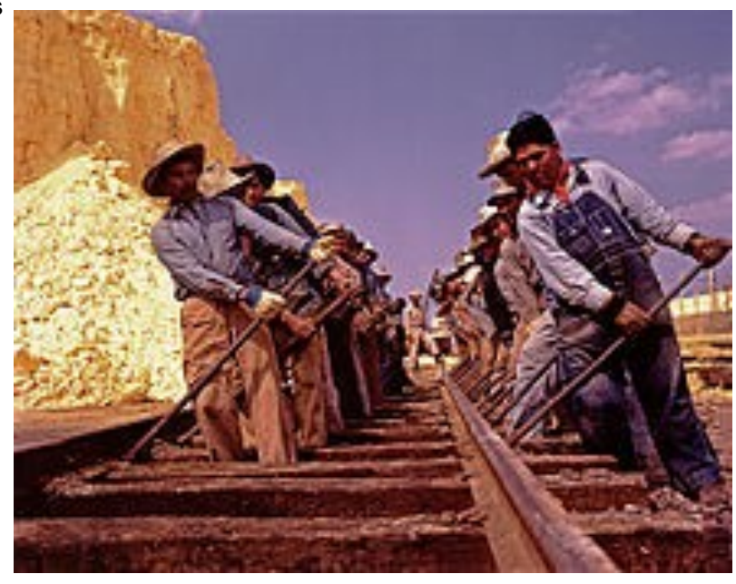
Gandy Dancers