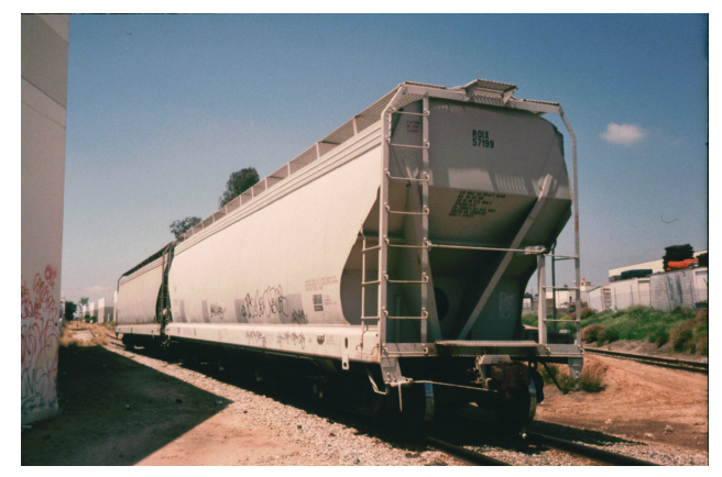
Hopper car.

• The Pacific Plastics Corporation on south Berry Street receives an average of eight 4-bay 55-foot centerflow covered hoppers of polyvinyl chloride pellets a week. The firm is a significant producer of PVC plastic pipe for the construction industry. Its product line includes pressure-rated pipe for potable water, reclaimed water, and various industrial fluids and non-pressure pipe for drainage systems, well casings, and communication lines.