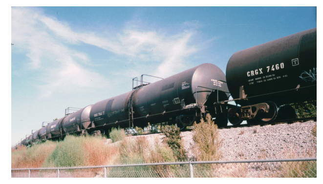
tributor. Vegetable oil from refiners in the mid-west and Canada arrive in 23,500-gallon Funnel-flow tank cars where it is unloaded and repackaged in bulk containers

the sole survivor. Establishment of UP's West Fullerton Industrial District maintained rail service to the many Hunt Foods and Industries operations headquartered there. For over 50 years Hunt, its predecessor, Val-Vita Food Products, and successor, Con-Agra Grocery Products, generated an impressive number of incoming and outgoing carloads for the UP and the AT&SF, and brought tax income to the city of Fullerton. With the breakup of the Hunt-Wesson Co., the Wesson Oil operation became Cargill Incorporated in 1990, transforming the facility into a major vegetable oil repackager and dis-