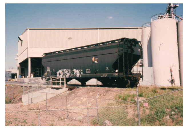
Above, black hopper car on Easterline Kirkhill Rubber spur. Top right, tank cars; middle right, Carghill Inc.; bottom right, remote control locomotive warning sign.

a month. Carbon black is the technical term for good old messy soot, a bi-product of most combustion processes, that is an important ingredient in many elastomeric (natural and synthetic rubber) products. Covered hoppers in this service are typically shorter 3-bay cars, usually painted (what else) black, whereas the plastic pellet cars, although they may have various reporting marks denoting car line ownership, are usually grey.