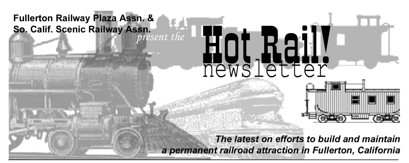
Issue IV, Number 1