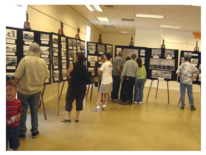
Railroad Days visitors intently study the updated rail history boards.

The HO-scale historic modules depicting three different eras in the history of Fullerton also received much-needed maintenance and updating, especially the Union Pacific diorama, which required the replacement of two of its main-line tracks because of warping and the wear and tear of multiple showings.