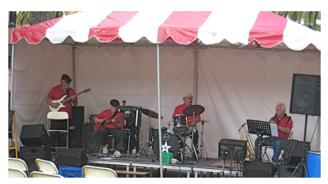
VOL. VIII NO. 2 - SUMMER 2010