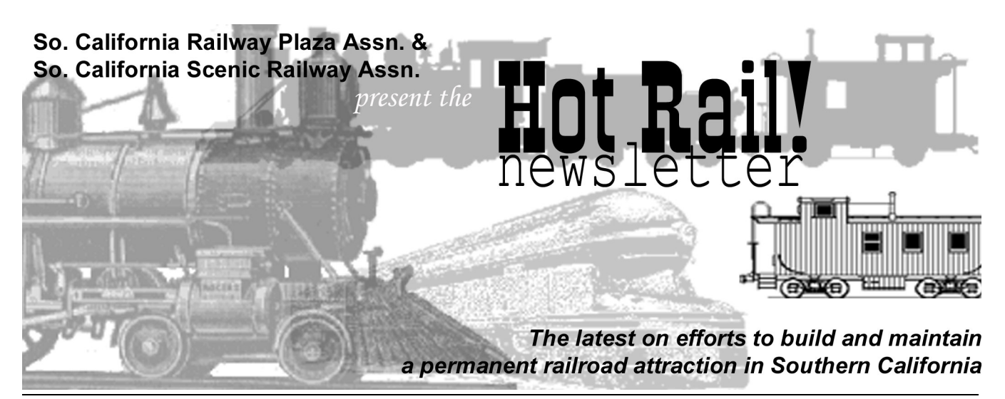
Volume VIII, Number 2