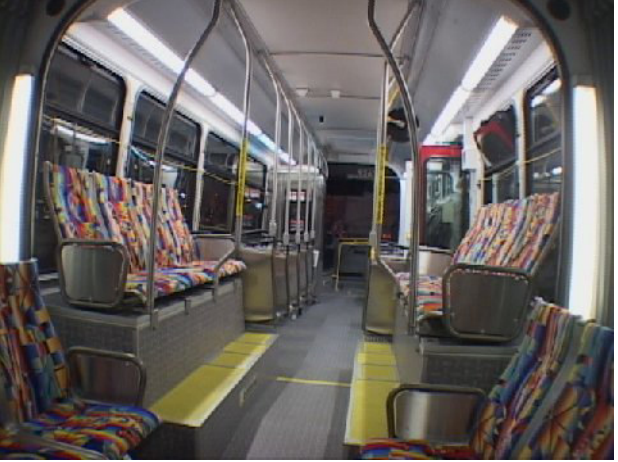
doors - or maybe because the Orange Line car interior.

As the busway ended one could see the last stretch of right of way curving sadly up into Canoga Park, a lush