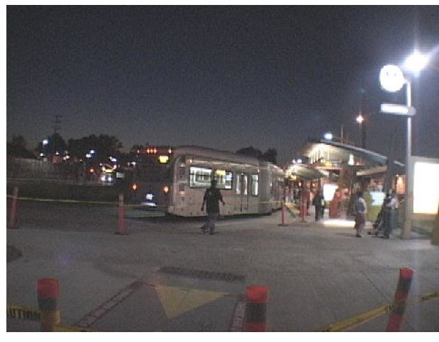
Orange Line station stop at night.

Charles' memories of "The Train That Did Not Go Down Manning Avenue" were recently published in the December 2005 issue of Trains Magazine.