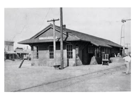
structure Tehachapi Depot, 1904. Southern Pacific

handful of SP's standard "Plan 23" depots still standing and the only one still in its original location was on the National Register of Historic Places. At the time of the fire, a three-year restoration of the historic was 90% complete.