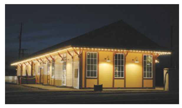
New Tehachapi Depot at Night.

When opened to the public in spring 2010, the station will house the Tehachapi Railroad Museum, a completely furnished freight office and a visitors center. Hardscape and landscape will create a park-like setting featuring the collection of longtime Tehachapi resident, retired SP railroader and rail buff Bill Stokoe. It includes more than 30 functioning vintage railroad signals, along with grass, flowers, walkways and hedges. A separate restroom facility created in the same architectural style