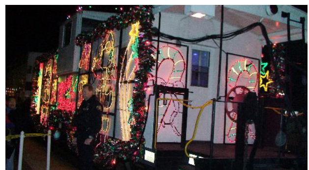
These photos are in color on the web! Read the Hot Rail! in PDF at www.scrpa.net