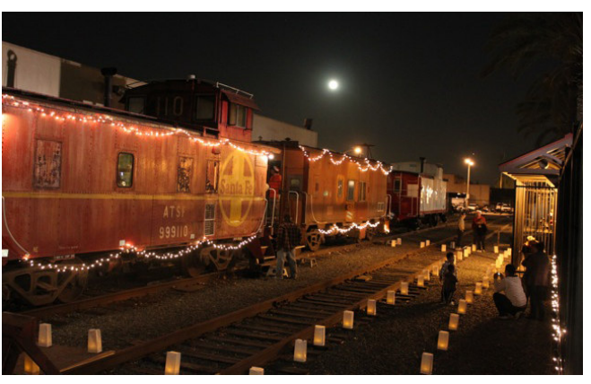
A full moon shines down on SCSRA's AT&SF cupola and SP baywindow cabooses, which were open for tours to show off their recent, substantial interior renovations effected by the SCRPA's Railroad Operations Committee.

Families and couples strolled through the area in steady but manageable numbers – and many voiced praise and appreciation for the fun activities to fill the time while waiting for the Express.