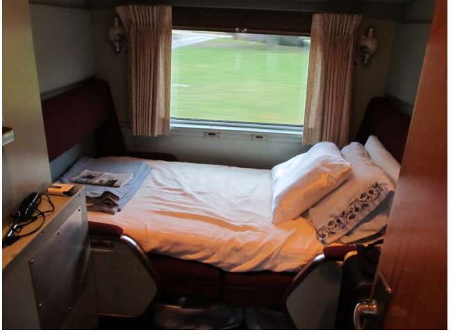
Two interior views from the private car Wisconsin, shown above.