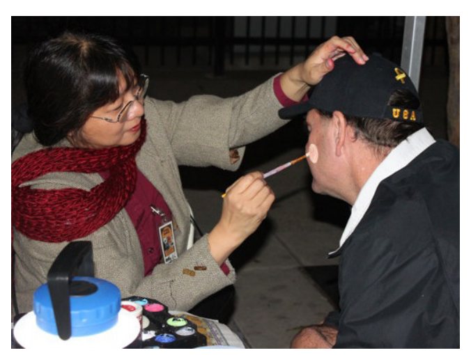
SCRPA volunteers staffed a number of tents that offered fun freebies to the public, like face painting.