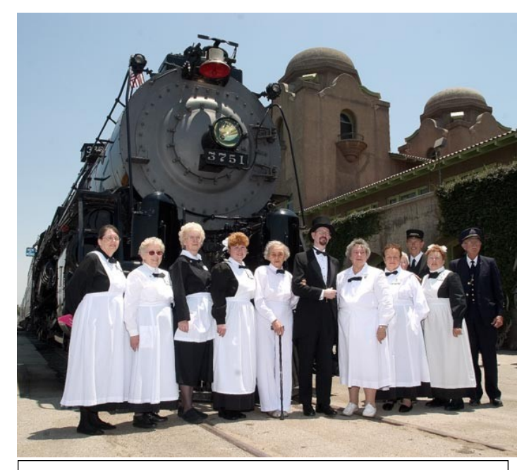
Former Harvey Girls dress in costume at a 2004 event in San Bernardino with Santa Fe 3751 steam locomotive.

The history of Harvey Girls will be featured during our winter Membership General Meeting program on Wednesday, January 16.