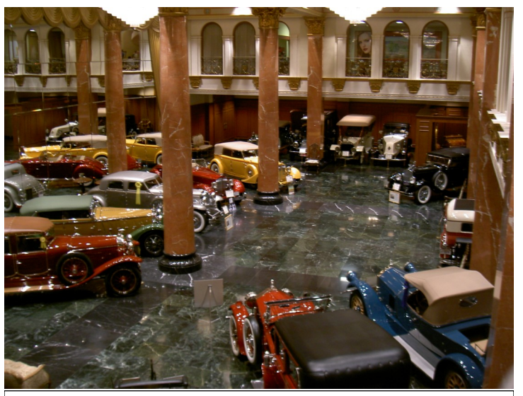
Nethercutt Collection hall replicates an early 1900s car dealer showroom with elegant trimmings and an amazing display.

Wood paneling on the walls, tile floors, stained glass windows and a small mechanical piano, found later but